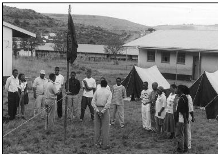
Troop Scouts in camp.